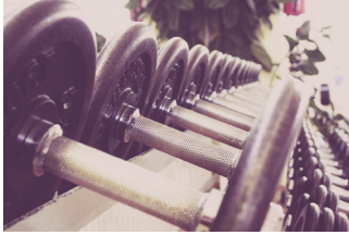
Illustration: Improving your physical fitness entails working out and some suffering. One puts forth the effort because the result is worth the momentary suffering.