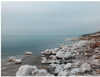
Illustration: In Israel, the Jordan River flows into both the Sea of Galilee and the Dead Sea. The Sea of Galilee is teeming with life as it has both an inlet and outlet. Nothing can live in the Dead Sea as it only has an inlet. Water can't flow out of it as there is no outlet and the water just stays there until it evaporates and becomes inhospitable to life.