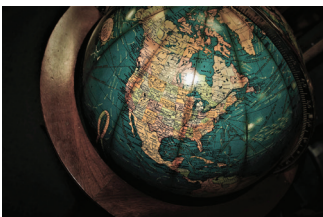
Illustration: All people who live in the United States, including Native Americans, are descended from people who left their homeland to move to a new place. Their actions impacted who we are and what we have become.