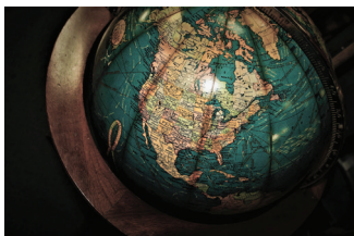
Illustration: All people who live in the United States, including Native Americans, are descended from people who left their homeland to move to a new place. Their actions impacted who we are and what we have become.