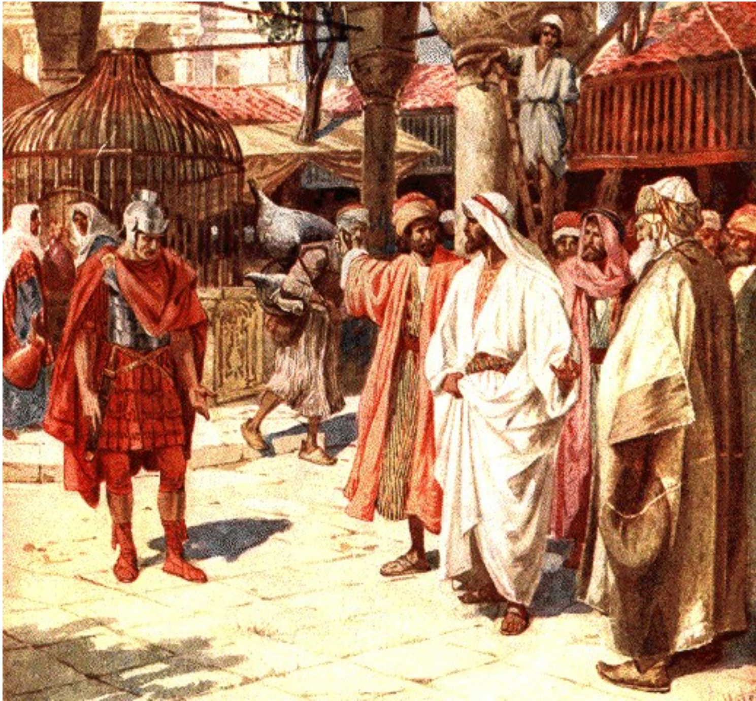
#15-1—The Centurion and Jesus