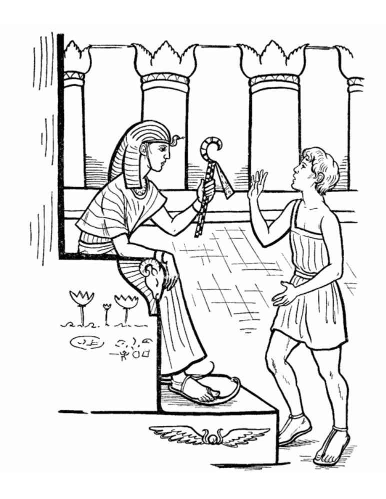
Good deeds show God's wisdom.