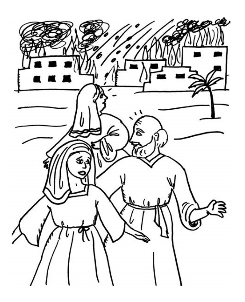
God rescues those who do what's right.