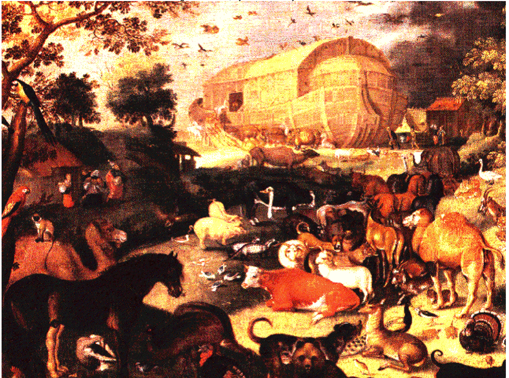
#29-2 - The animals entering the ark