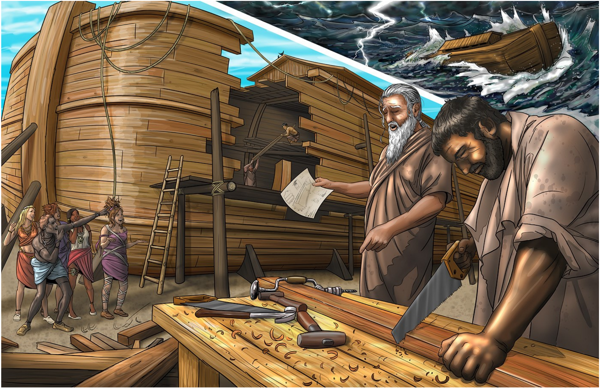
#29—Noah building the ark