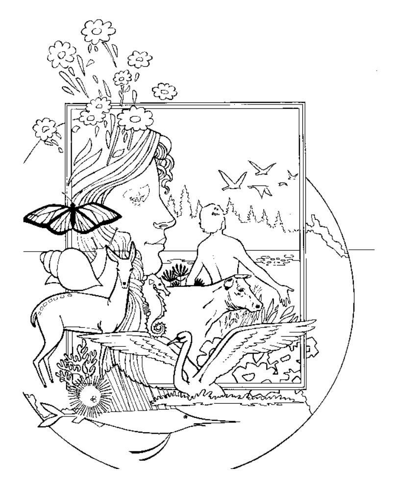
When God is our shepherd, we have everything we need.