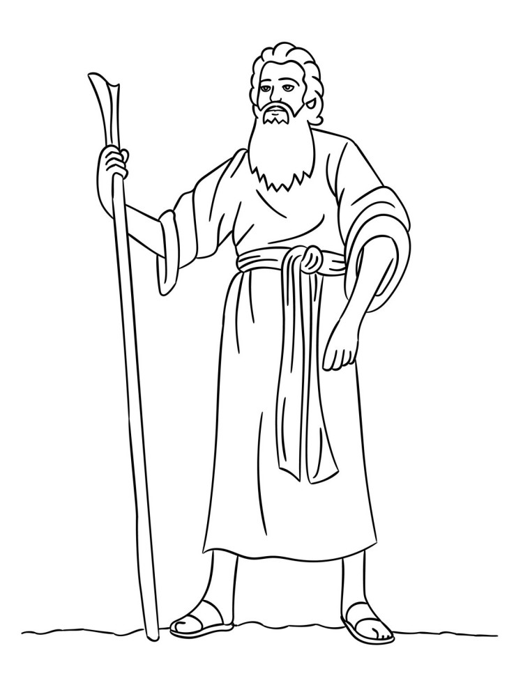
God's messenger faithfully shares God's truth.