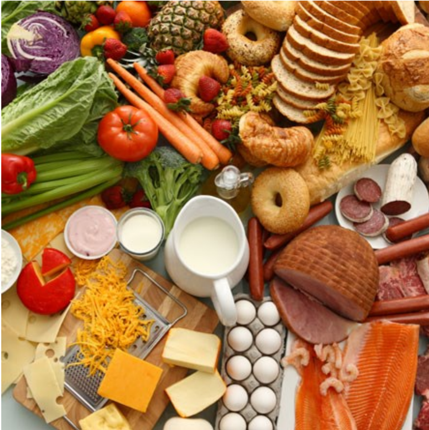
#18 - The Food Given to Man