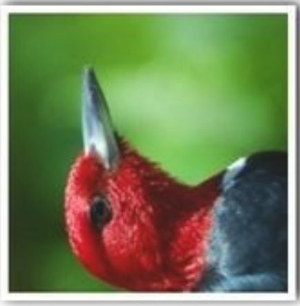
13-5—Types of Beaks and Bills