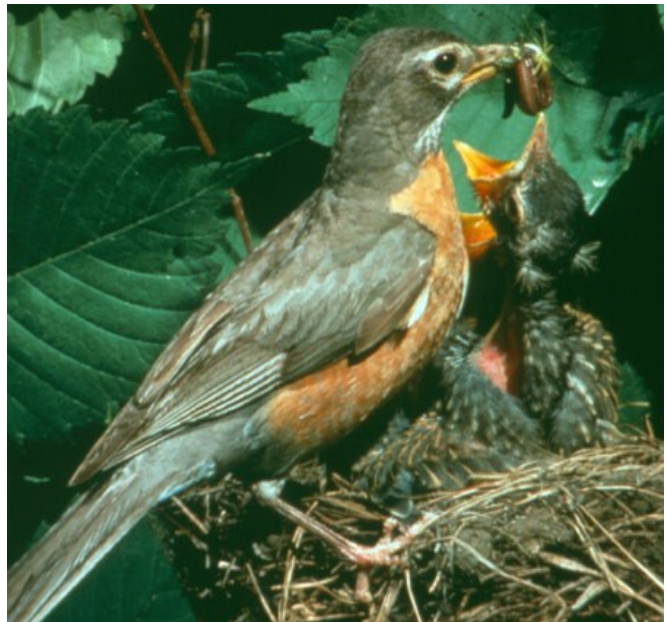
13-4—Bird Nest & Eggs