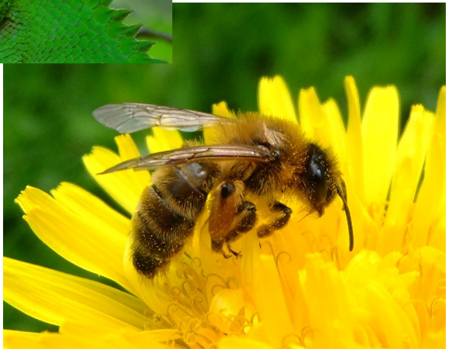
13-2—Value of Insects