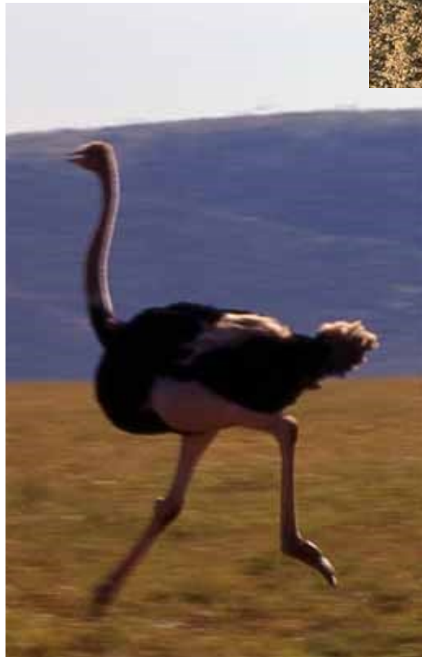
13-3—Bat and Non-flying Birds