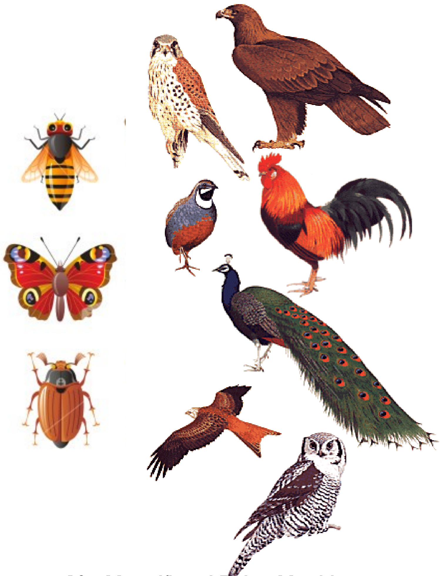
#13—Magnificent Flying Machines