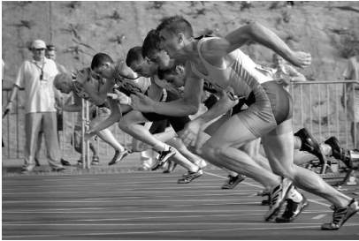
Illustration: With the second idea of equality, in running a race each runner would have a different starting time to ensure that everyone crosses the finish line at the same time, or there would be no finish line so that no one wins and leaves others in a lesser position.

What are some examples of how the second idea is dominating our culture? Everyone who participates gets a trophy, affirmative action, Title IX athletics (men and women must have equal opportunity to participate in sports), tax system/welfare (take from rich to give to poor), free college tuition for everyone